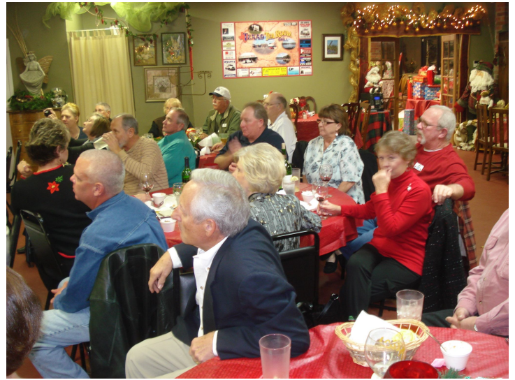
Members watching the year in review presentation