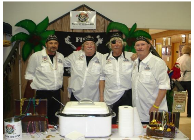
The crew getting ready to serve up Chili