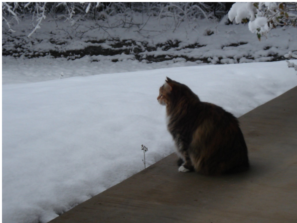
When will it be Spring????