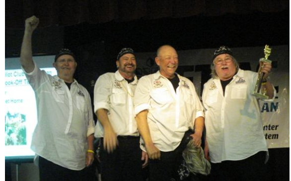
The Pirates holding up their booty!

The Pirates of the Chili-Bean hijacked multiple prizes at the Chili Cook-Off in Quitman. We won the Best Showmanship Award, Best Overall Booth Award and the Rowdiest Team Award, and we took 2nd place for the Peoples Choice Award with about $280 in tip jar collections. Our chili didn't take a top honor, but other contestants were coming to us for bowls of chili and putting money in our tip jar. That says something --- Thanks to all of the LFSA members who showed up and supported the team's efforts.