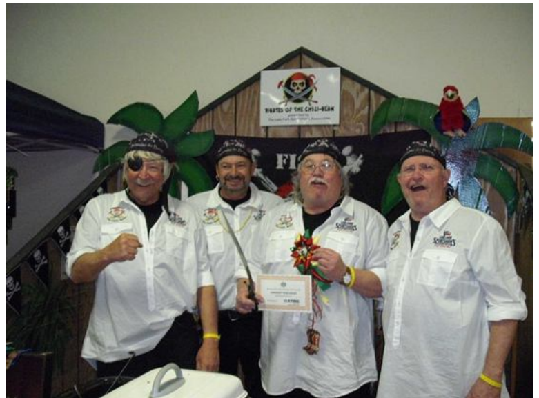
Winning the Rowdy Award